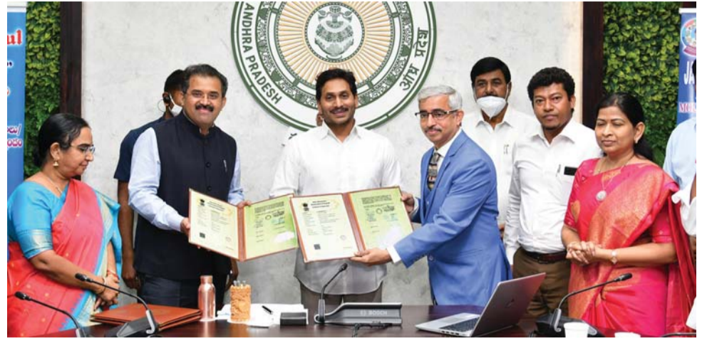
VIS News Service

Chief Minister Mr. Y.S. Jagan Mohan Reddy virtually launched the Jagananna Pallavelluva programme in Anantapur district. GoAP has entered into an MoU with Amul for supplying milk for Balamrutham and anganwadis. Highlighting the fact that Amul is the eighth largest company in the world