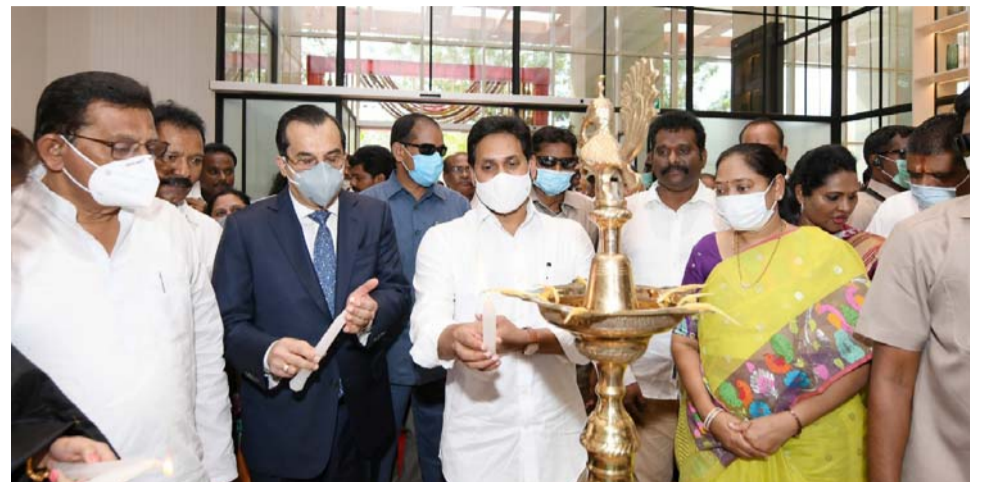
The Chief Minister Mr. Y.S. Jagan Mohan Reddy Lighting the Lamp to mark the Inauguration of ITC Welcom Hotel in Guntur along with ITC CMD Mr. Sanjiv Puri

ITC Welcomhotel Guntur has been awarded Platinum rating under LEED NC (New Construction) program in 2021. Platinum rating is the highest category of certification preceded by Gold and Silver Certified. This certification attests to Welcomhotel Guntur's commitment to sustainability with energy-efficient green buildings, utilization of renewable energy, conservation and recycling of water and concrete measures to preserve the ecosystem.